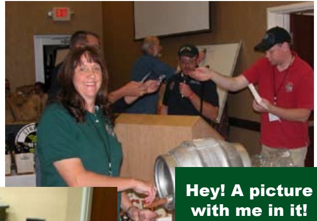
Hey! A picture with me in it!