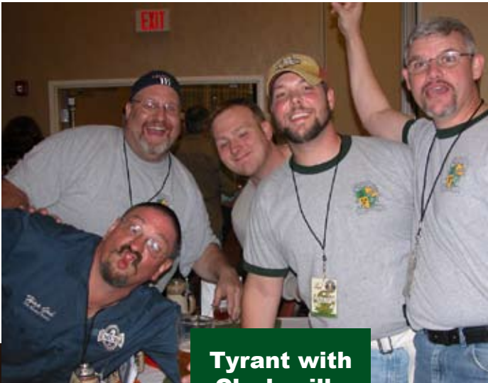
Tyrant with Clarksville Carboys