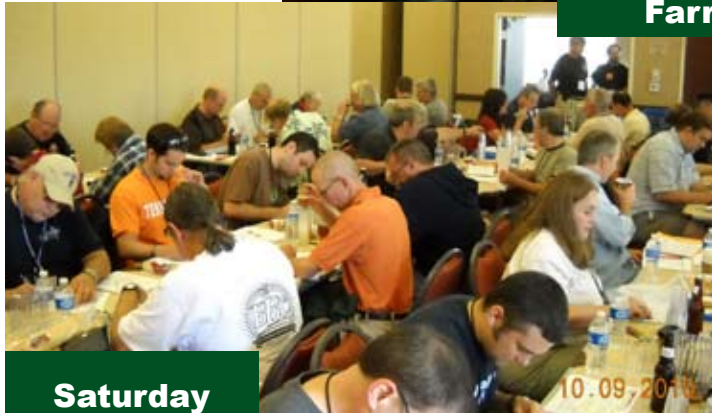
Saturday Judging Session