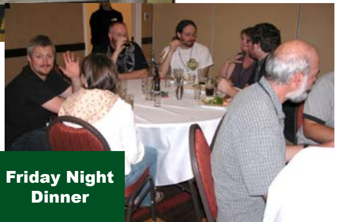
Friday Night Dinner